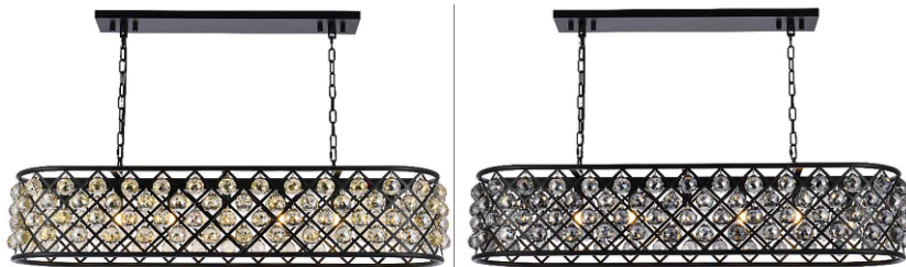
Matte Black Item No:1216G50MB-GT/RC